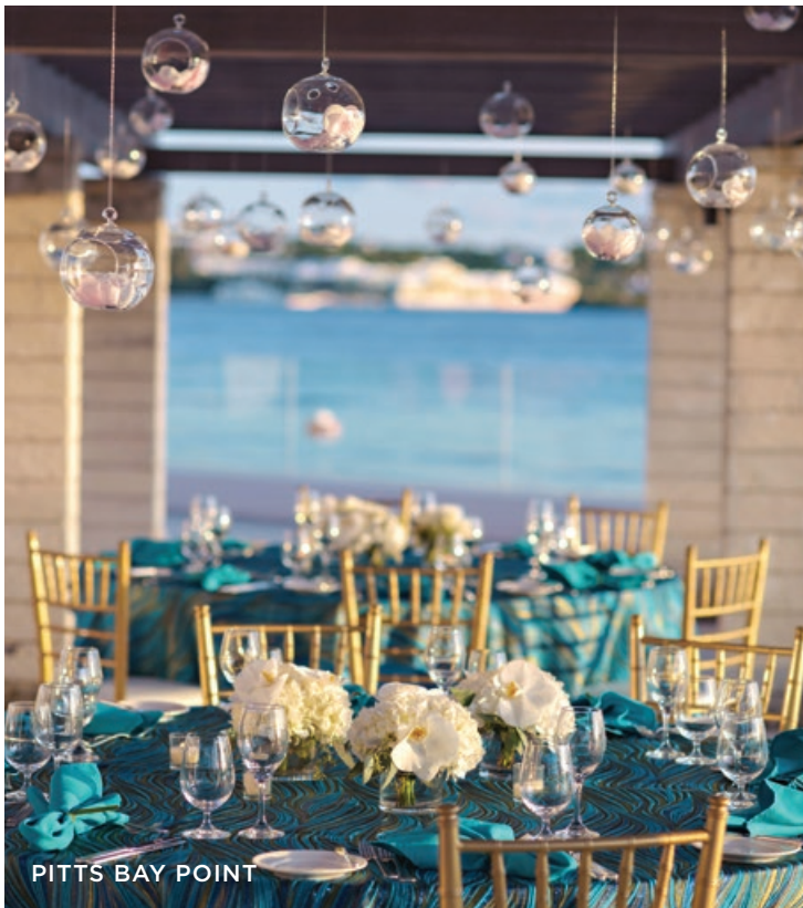
PITTS BAY POINT